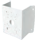
TD-YZJ0601 Corner Mount