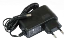
24 V 0.38 A power adapter